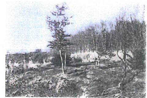
PHOTO 3 Looking North West from the proposed site Along the North West Robust Boundary – again Note the dense Sycamore planting along with Other more recent planting