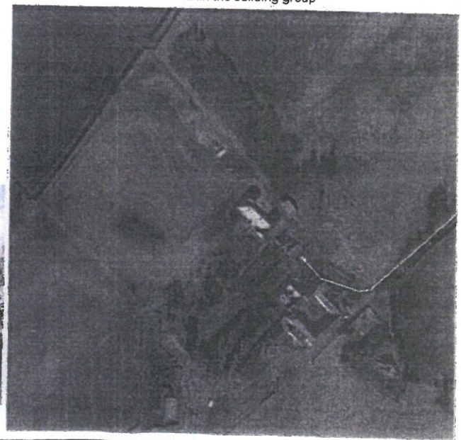
AERIAL PHOTO Demonstrates how the the building group has developed on a South East to North West access and highlights the incompatibility of including the site to the North East (document 1) within the building group