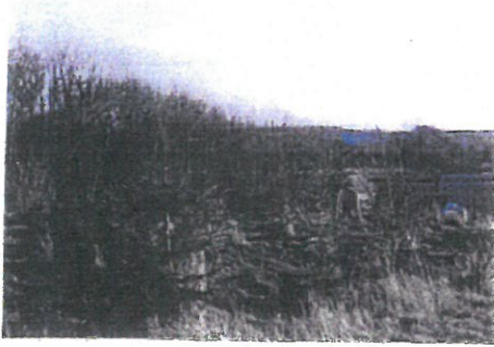
PHOTO 1 Looking South East toward the proposed site along the North East Robust Boundary Note the dense Sycamore Planting.