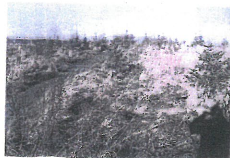
PHOTO 4 Looking West, highlighting the mixed planting Carried out in the Buffer Zone.