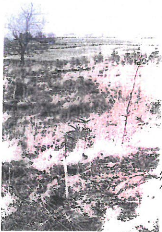
PHOTO 2 Looking West from the proposed site Come mature planting but note the conifer Planting along the North West Robust Boundary